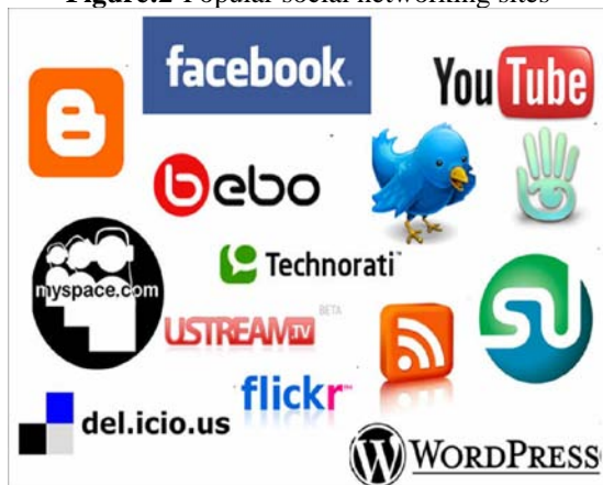
Figure:2 -Popular social networking sites

serious leisure activities to rival other forms of entertainment such as television.